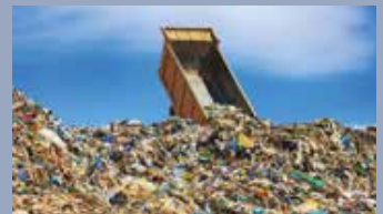
WASTE AND RECYCLING