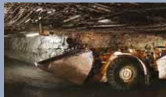
MINING AND QUARRYING