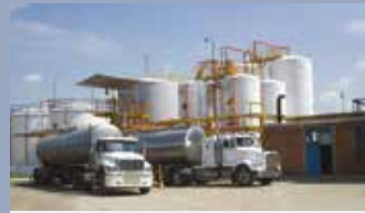
GAS AND OIL PLANTS